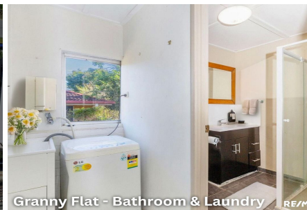
Granny Flat - Bathroom & Laundry