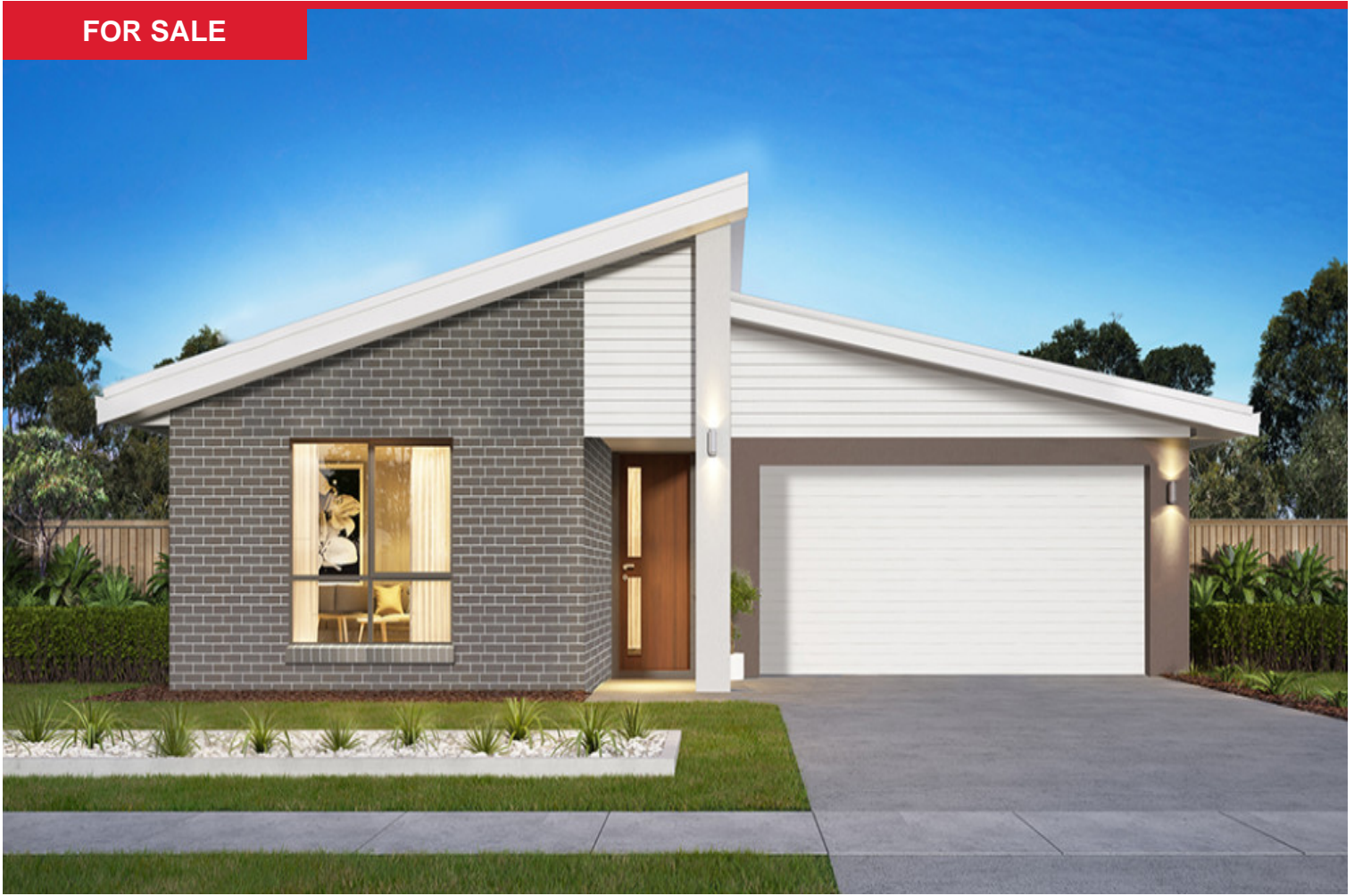
VERANO GEN V - F4 QM LOT 15 AREAS: Living - 146.3 m 2 | Garage - 37.0 m 2 | Patio - 2.4 m 2 | TOTAL 185.7 m 2